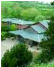
Ellis Theatre Marlborough College