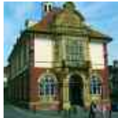
The Town Hall