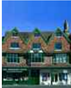
The Merchant's House