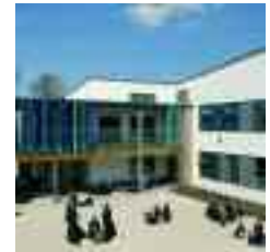
St John's School